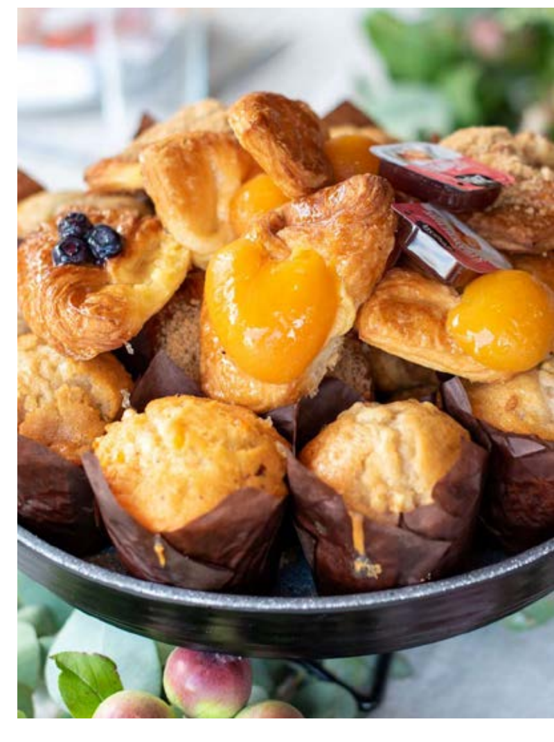
*Sample photos only. Please speak to the Events Team for catering confirmation.