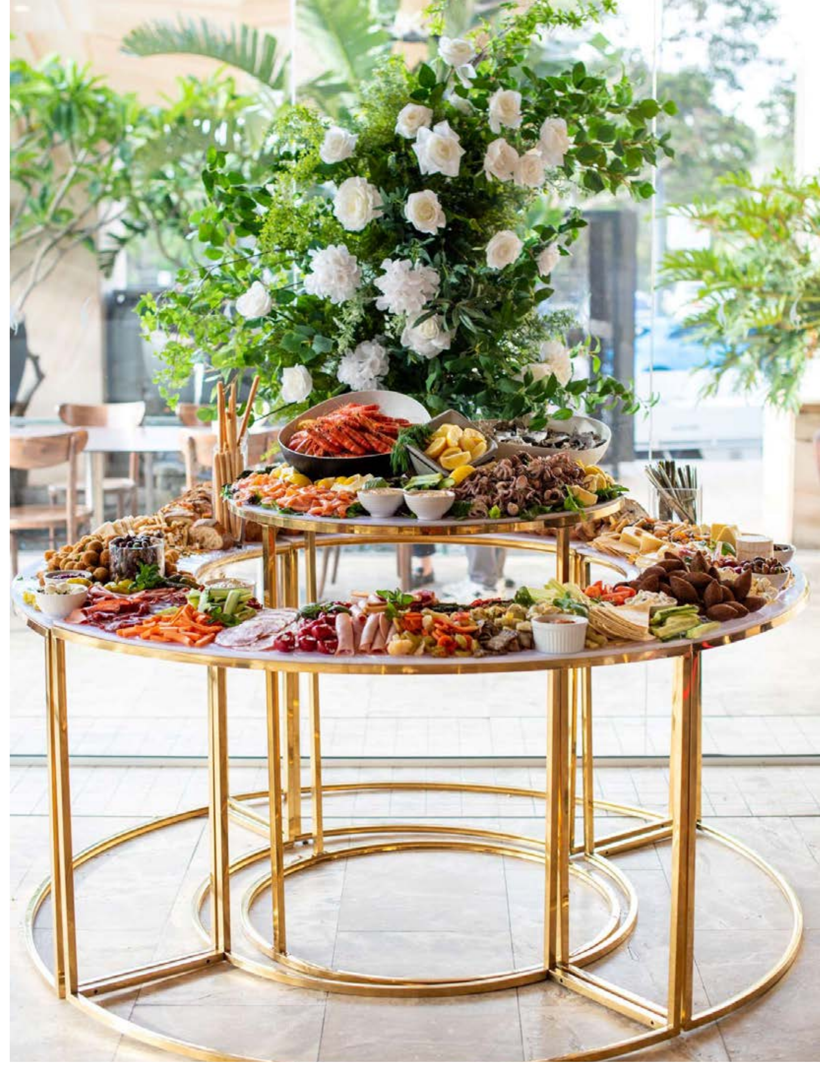
Decorative Tables & Accessories not included* Please contact your Events Co-ordinator for more information.